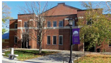
Plumley Building, Norwich University

Contact: Bruno Gubetta 7 East Countryside Road Waterbury, VT 05676 802-244-1789 bruno@AlpineRestorationVT.com AlpineRestorationVT.com