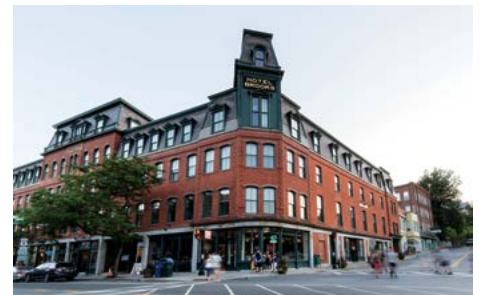
Brooks House – 1871, Brattleboro, VT. Stevens & Associates provided architecture, engineering, and development services.