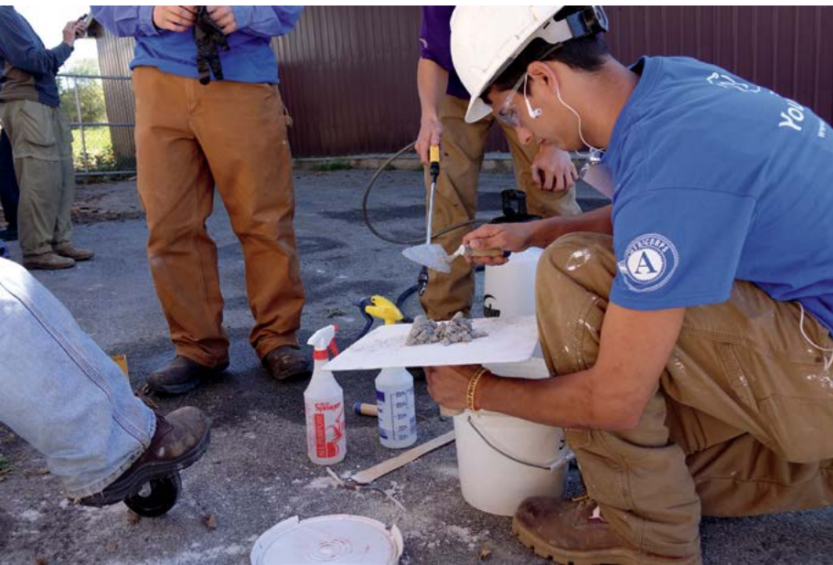
Youth Build in action at the Rise Up Bakery in Barre, VT

W e are fortunate here in Vermont to have many people who are passionate about their communities and are willing to spend their time volunteering. People volunteer because it offers the chance to give back to the community and share their expertise. For others, it's an opportunity to spend time with people who share their interests. Still other volunteers are eager to develop new skills, gain fresh experience and acquire new knowledge. No matter what the reason, volunteers play a very important role in the preservation community and in restoration projects around the state. Here are a few tips to help you recruit and retain volunteers.