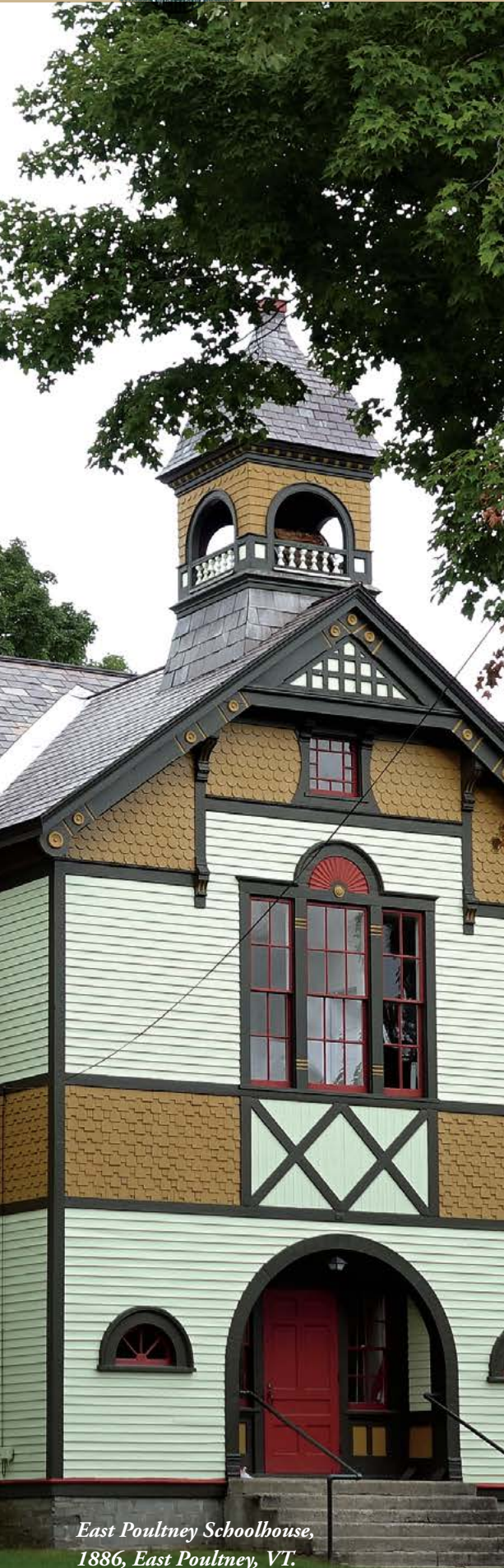
East Poultney Schoolhouse, 1886, East Poultney, VT.

The Preservation Trust of Vermont is pleased to present the