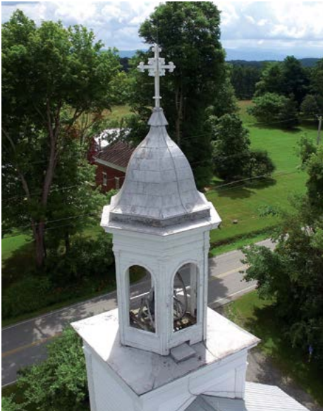
CRM Associates drone photo-inspection of Charlotte church bell tower.