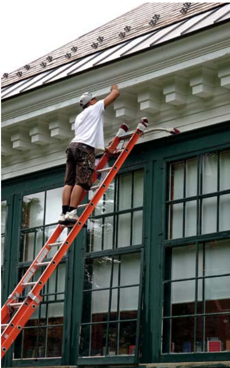
Pawlet Library, Pawlet, VT

Procurement is part of any grant process. Try to keep it simple, work with the grantor, and the process will go smoothly. Above all, don’t start your project until you are sure that all of the grantor requirements have been met.