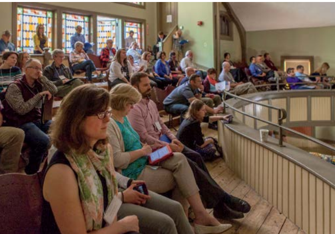
Holley Hall, Bristol, VT

Have fun with it and always remember to say thank you!