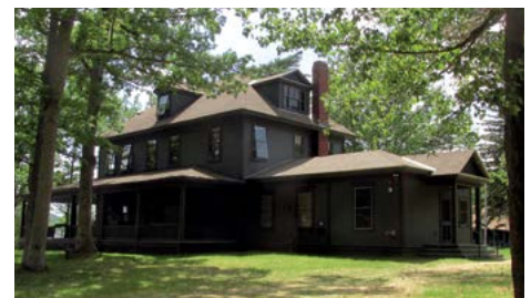
NBF Architects was hired to convert the historic Keewaydin Manor House into year-round office spaces for the Foundation staff. The design restored the third floor of the building and widened the existing dormers to create a bright, open office space. A one story addition was constructed on the north end of the manor house to provide an additional entrance, mudroom, and storage.