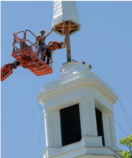
Salisbury Congregational Church

Contact: Ben Dunham 39 McCarthy Road Marshfield, VT 05658 802-563-3510 802-279-2417 ben@watershedvermont.com www.watershedvermont.com