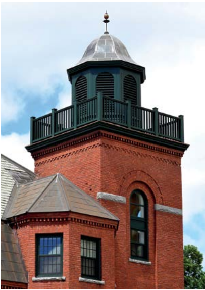
Waterbury State Complex Restoration

Vermont is a special place. While much of the rest of the country has lost valuable resources with modern development and sprawl, the essential character of our state remains intact. Working to preserve this character keeps our state vital. Preservation keeps Vermont, well, Vermont.