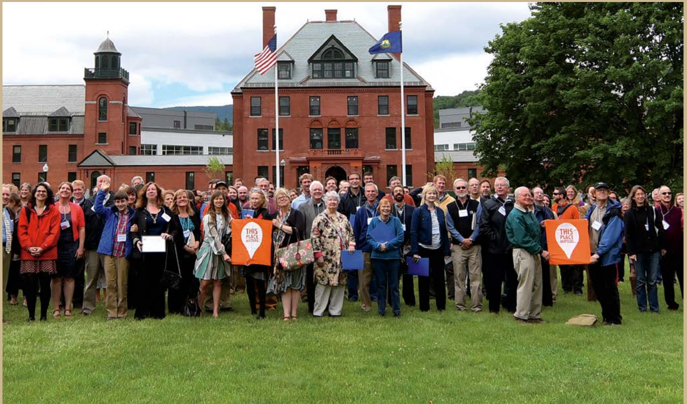
This Place Matters, 2016 Historic Preservation and Downtown Conference, Waterbury, VT