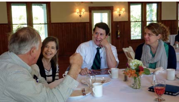
Preservation Retreat, Grand Isle Lake House

Celebrate your success! Having a community celebration is a great way to honor the people who contributed to your project and to invite the public to share in your achievements.