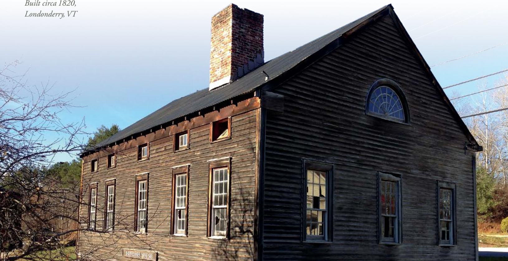
Built circa 1820, Londonderry, VT