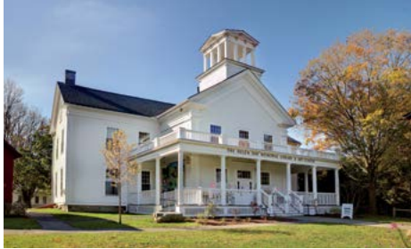
Stowe Free Library and the Helen Day Art Center, Stowe, VT